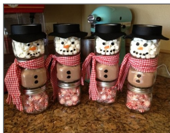
Photo Collage Craft

Take a few recycled items and some scrapbook paper and put it together and you will have an adorable picture craft to give away or keep!